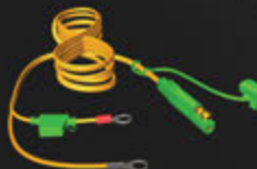
Terminal Lug 2110 - 2' 2087 - 6'