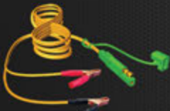
Alligator Clip-On 3752 - 6' 3515 - 20'