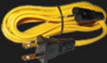
AC Power 2580 - 10' 1076 - 20' 1951 - 30' 1801 - 40'